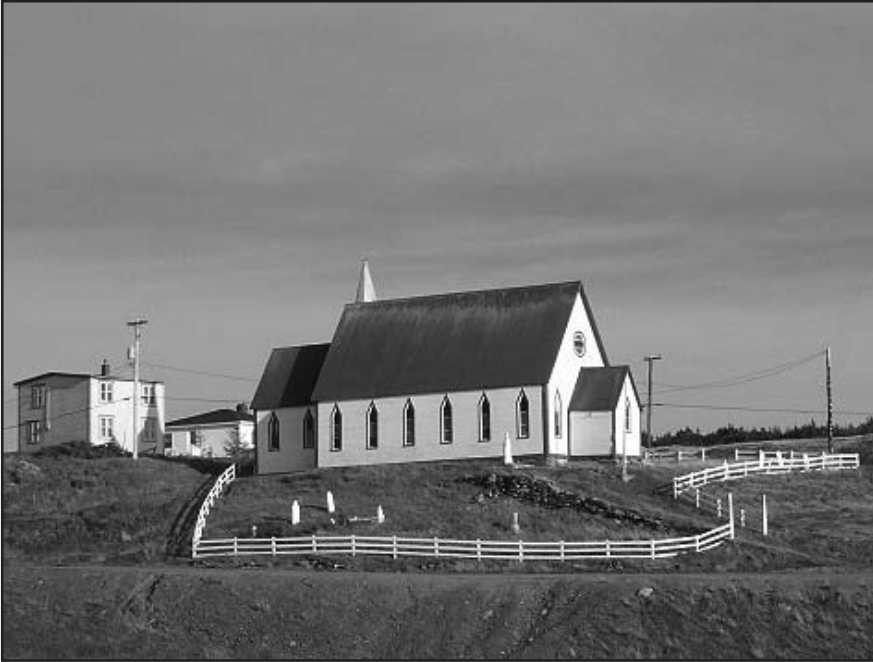
English Harbour All Saints Church

is no shelter from the wind, which sometimes means we lose the odd dish cloth.”