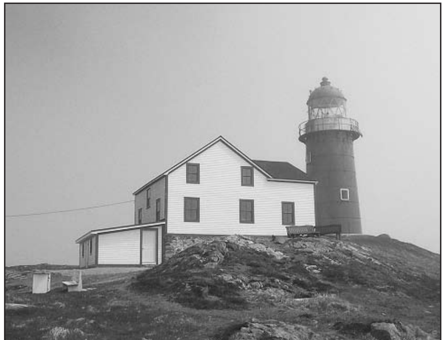
Ferryland Lighthouse