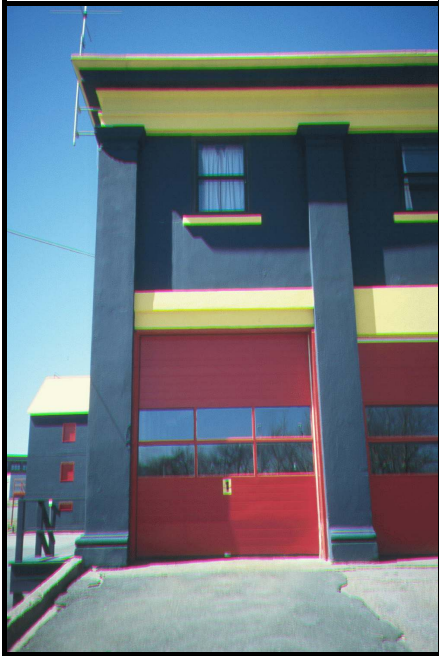
Front Facade, pilaster and door detail