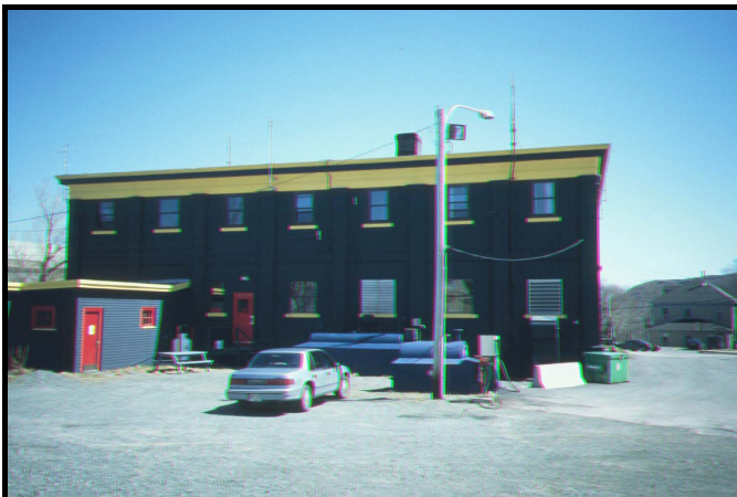
Fire Station, rear facade